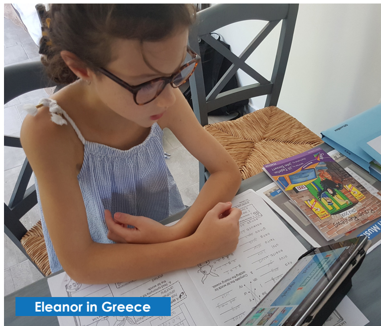
Eleanor in Greece

Payment can be made by Credit Card (Visa or MasterCard only) or Parent Online Payment.