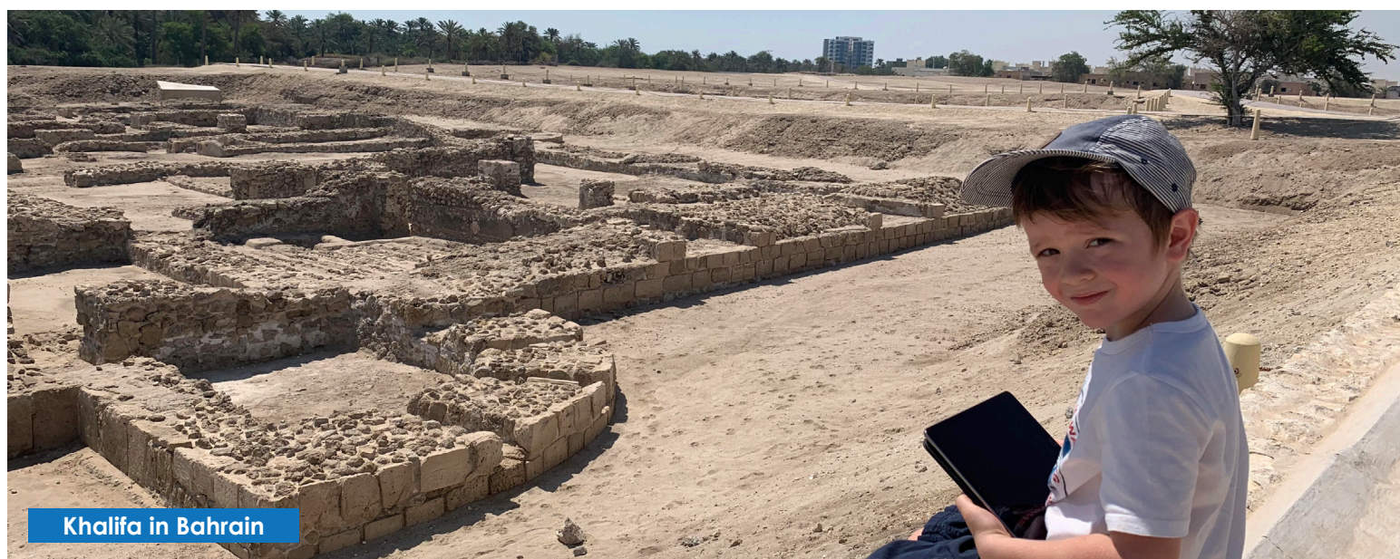
Khalifa in Bahrain

Our school has a student portal called mySDEPS. This is a web based platform where students and supervisors can access our IT Helpdesk and software support, video tutorials and user guides. Contact the school for further information.